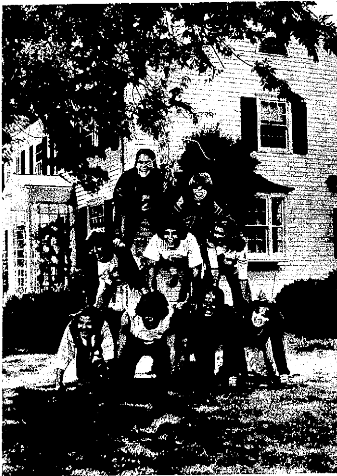
(Bottom l. to r.) Lani O'Grady, Grant Goodeve, Dick Van Patten, Susan Richardson, (middle row, l. to r.) Connie Newton, and Adam Rich will all be seen this fall on ABC's hit series 'EIGHT IS ENOUGH,' beginning its first full season on Wednesday, Sept. 14.