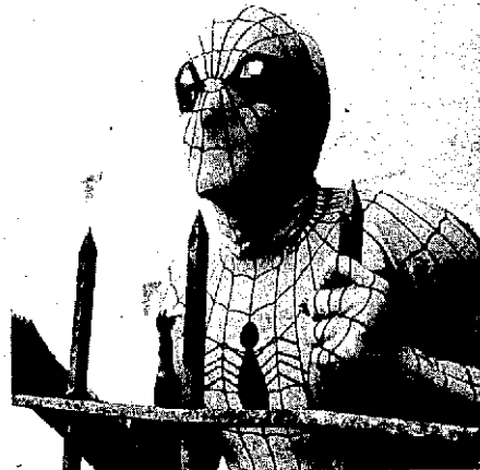
Nicholas Hammond stars as Peter Parker, a young physicist who achieves mysterious super-human powers after being bitten by a radioactive spider, in the television production of the number-one comic book superhero, 'SPIDER MAN,' Wednesday, Sept. 14 on CBS-TV.