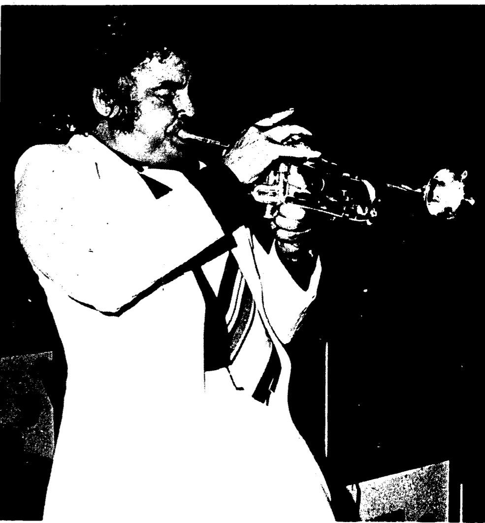
JAZZ ARTIST MAYNARD FERGUSON IN CONCERT ...will appear in Norwalk Nov. 23 for T&C benefit.